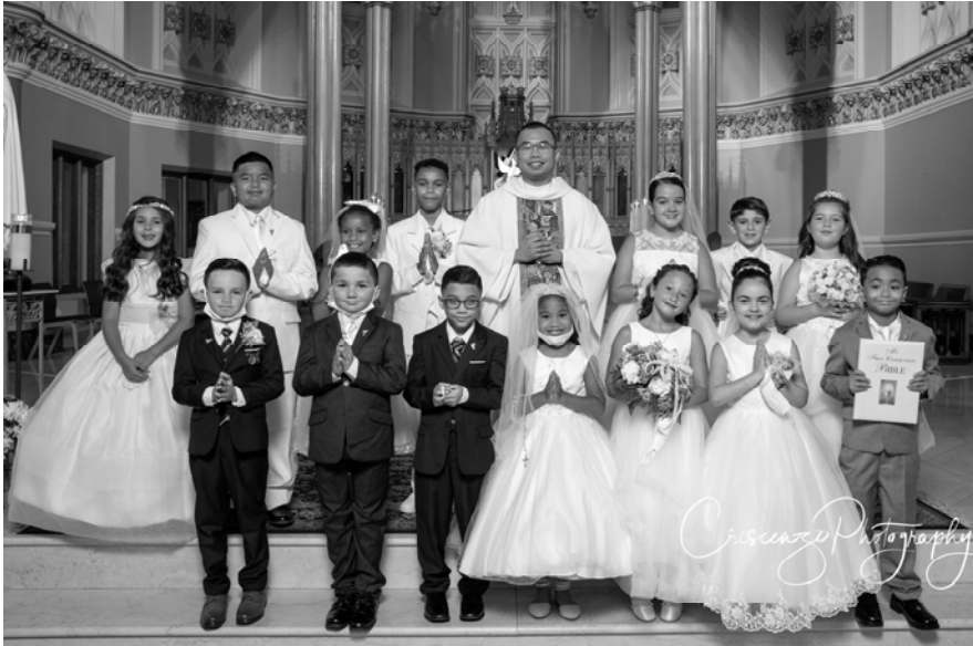
First Holy Communion - August 15, 2020