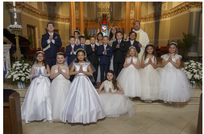
First Holy Communion 2025