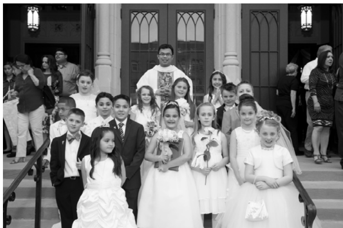
Saturday, May 9, 2015