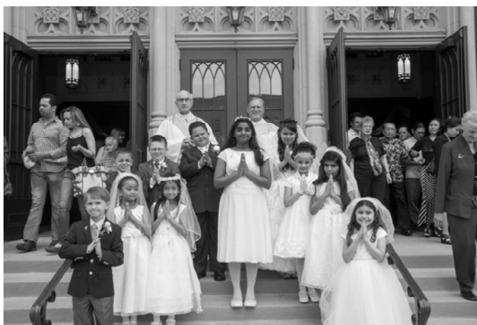
Sunday, May 10, 2015